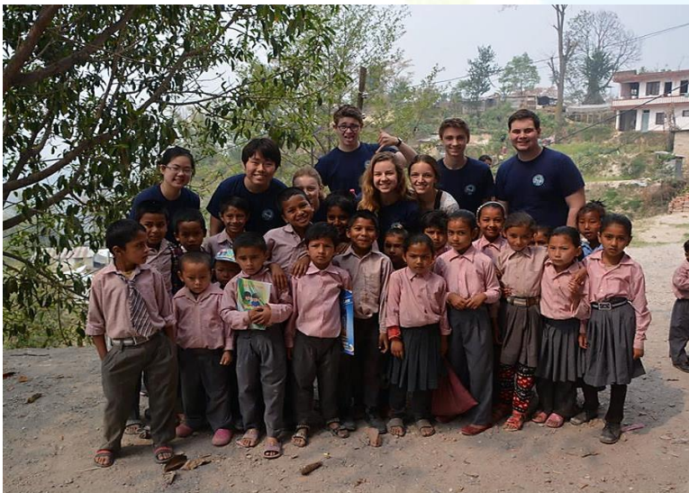
After a successful CAS project in Kavresthali

Founded more than 40 years ago, the International School of Düsseldorf (ISD) is a flagship International Baccalaureate World school. It's an institution that fosters an awareness and concern for the well-being and dignity of every individual.