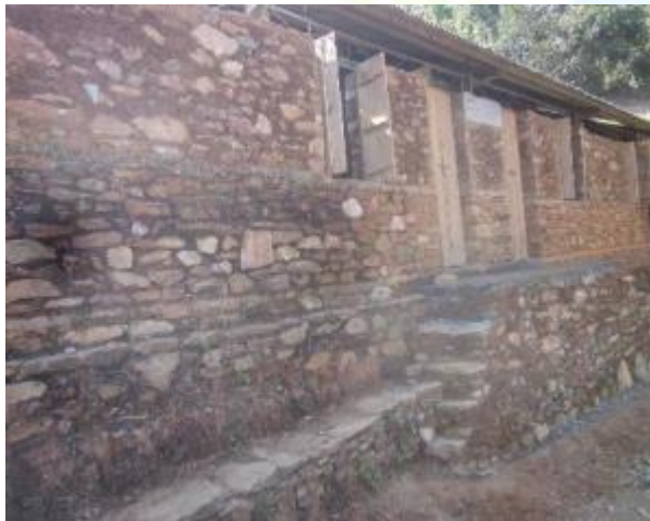
Taluwa-9: Saptakanya school, after renovation

In 2016, we supported the renovation of 5 damaged schools and the construction of school toilets in 5 schools.