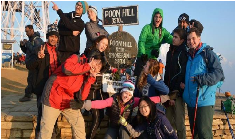
Sunrise at Poon Hill