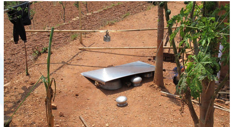
Solar cooker being used