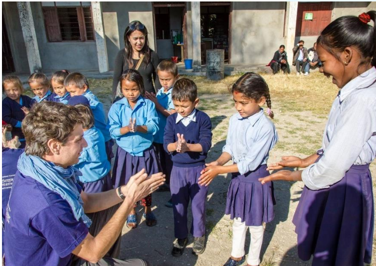
Raise Health Awareness

We believe in the equal opportunities of women in Nepal, therefore we have created a variety of projects which assist women to overcome current adversity to not only survive, but thrive in society. Through this program VIN volunteers have a chance to assist women's empowerment , by boosting literacy and health education, providing income generation tips and micro credit loans.