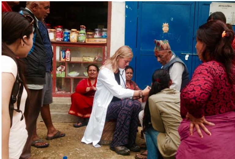
IFMSA student performing health checks in Kavresthali

IFMSA is an international platform for medical students. They address global health problems by organizing projects to create awareness about different aspects of global health problems.