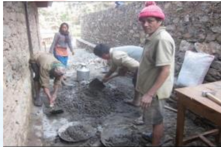
Bhadaure-7: Shree Kalika primary school during its renovation