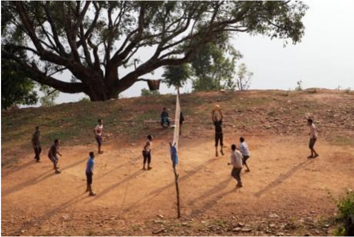
Youth playing volleyball in a village