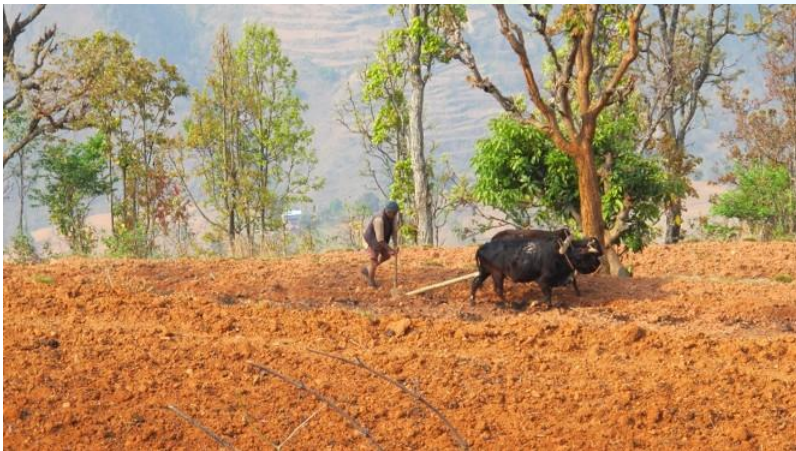
Ploughing in field in Okhaldhunga

Each VDC is divided into 9 wards, home to approx. 1900 households, with a total population of around 10,000 people. There are now 24 schools and 20 Early Childhood Development (ECD) centers.