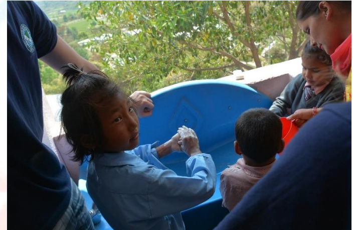
Teaching tooth brushing and handwashing

For the 3rd time, FoVIN took students and teachers from ISD on a trip to Nepal. The first part of the trip consisted of trekking through the beautiful Himalayan villages in the Annapurna foothills and the students experienced life on the same trails travelled by local people between villages and schools. Upon the return to Kathmandu, they engaged in a 3-day community service project, decorating and furnishing one ECD classroom and painting 2 others.