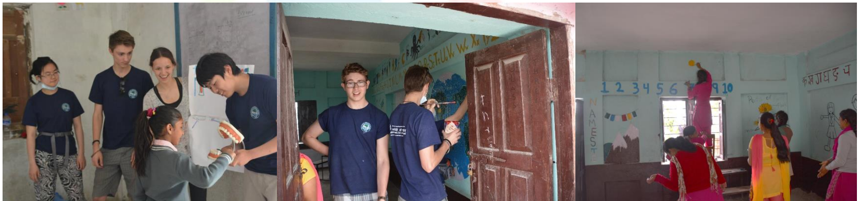
ISD students and Local students painting