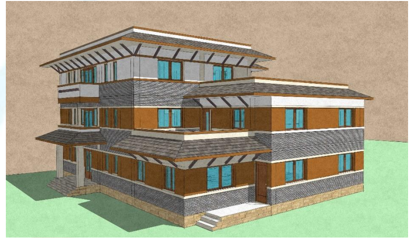
Architectural rendering of the CLC

We value a pragmatic and realistic approach to societal issues, prioritizing above all self-sustainability. A CLC will be a crucial vehicle in empowering the communities in Okhaldhunga. It will have multiple benefits; it will offer a place to conduct various trainings (literacy, life skills, income generation, computer and internet, sanitation and hygiene training, earthquake resistant home construction, entrepreneurship and many more); a place for women to hold their monthly meetings and their annual assembly; it will house the first-ever library in the region and overall, it will decrease the amount of people migrating to either the bigger urban areas or overseas, and thus ensuring the well-being of continuation of rural communities.