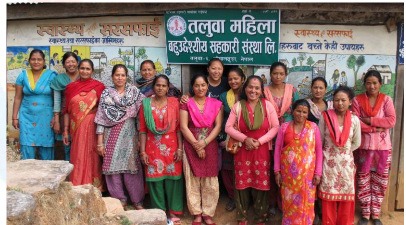
With ward representatives from the Women's Agricultural Cooperative