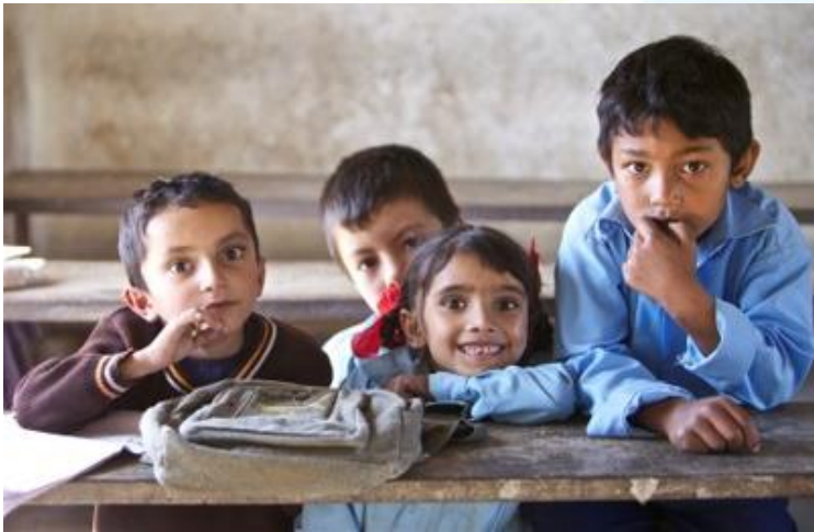
Secure children right to Education

Our Youth Empowerment volunteer program aims to inspire and encourage the youth of Nepal. Involve the youth in different community development programs by giving them trainings on social and professional skills. Ensure the youth to become pro-active and responsible towards their community promoting change and empowerment.