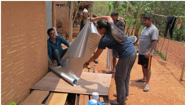
Preparing for the Solar cooker