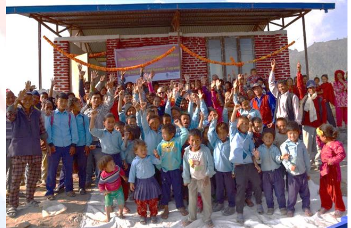
Preparing for the Solar cooker